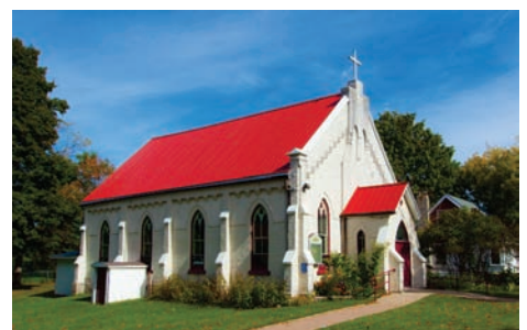
SACRED HEART - WARMINSTER