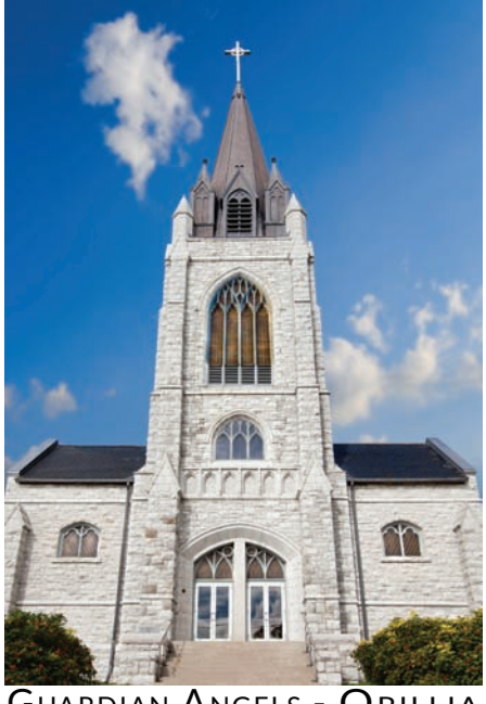
GUARDIAN ANGELS - ORILLIA