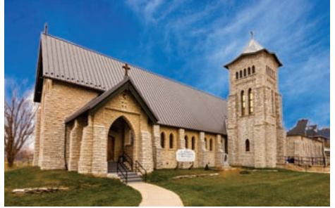
St. Andrew's - Brechin