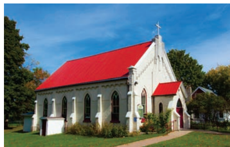
SACRED HEART - WARMINSTER