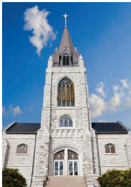
GUARDIAN ANGELS - ORILLIA