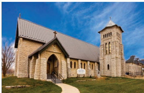
ST. ANDREW'S - BRECHIN