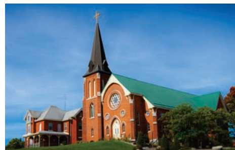
ST. COLUMBKILLE - UPTERGROVE