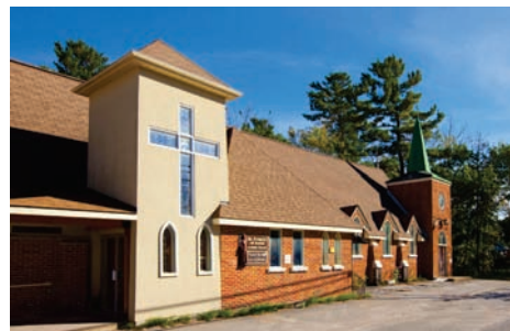
ST. FRANCIS - WASHAGO