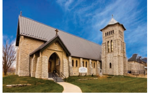
St. Andrew's - Brechin